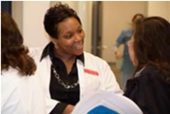
Longview Wellness Center, dba Wellness Pointe Longview, TX