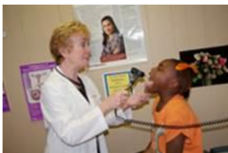
Pediatric exam at Health Opportunities for the People of East Texas, Inc. dba HOPE Project Tenaha, TX