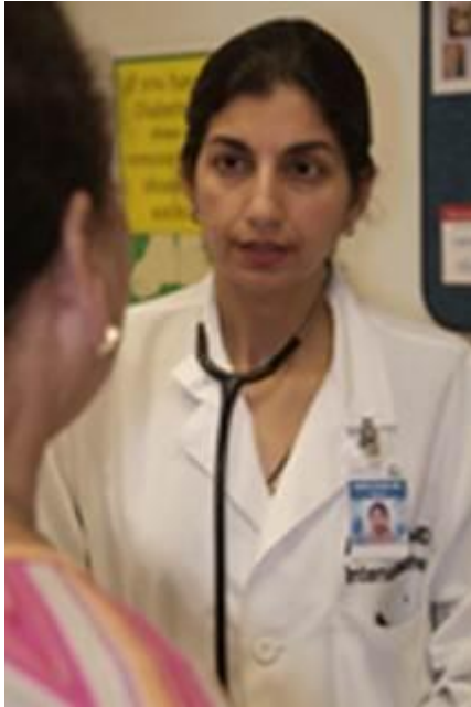
Patient Exam at Su Clinica Familiar Harlingen, TX