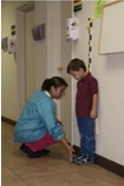
Patient Exam at South Texas Rural Health Services Cotulla, TX