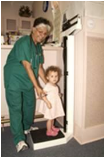
Patient Exam Frontera Healthcare Network, Eden, TX